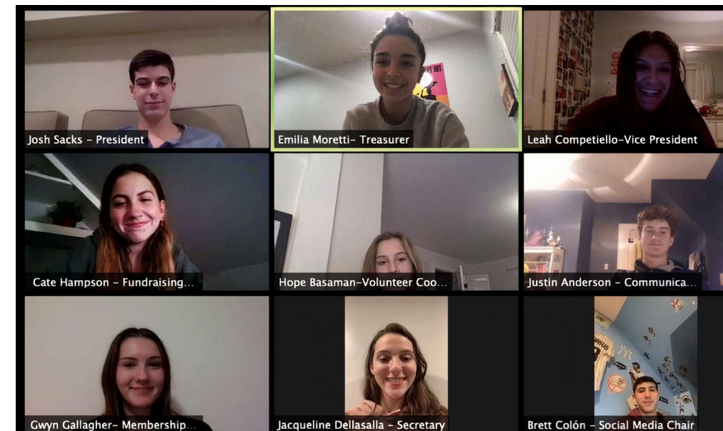
Family Promise Club tutors are helping children at Family Promise Union County navigate the complexities of remote school during the health pandemic.