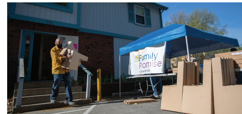
The temporary housing apartments at Family Promise of Lawrence are move-in ready thanks to IKEA.