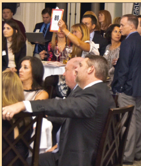
Place your bids!

gifts and donations, including nearly $100,000 pledged for the development of three new Affiliates nationwide. We gratefully acknowledge our sponsors: Guggenheim Partners; Ernst & Young; Johnston Asset Management Corporation; Bench International; Celgene; S. Rubenstein Family Foundation; Chubb Group of Insurance Companies; Fidelity Investments; Point View Wealth Management, Inc.; Basset Associates; Bourne, Noll & Kenyon, P.C.; The Glenmede Trust Company, N.A.; Lindabury, McCormick, Estabrook & Cooper, P.C.; Lois Schneider Realtor; The Other Fellow First Foundation.