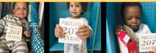
Portland is Affiliate #207—same as Maine's area code.