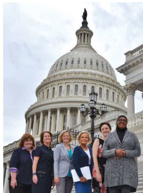
Family Promise storms the Hill.

Department of Housing and Urban Development (HUD) Funding: We support the ask that HUD's Homeless Assistance Grants be funded nationally at $2.6 billion in 2018. This would end homelessness for 40,000 more people and allow communities to keep up with rising needs due to lack of affordable rents.