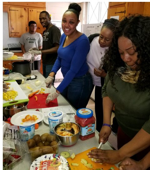
Being educated on nutrition and healthy eating habits is just one stepping-stone on the path to success.

Family Promise Union County (FPUC) has created an educational workshop series that helps struggling families hone skills critical for long-term success.