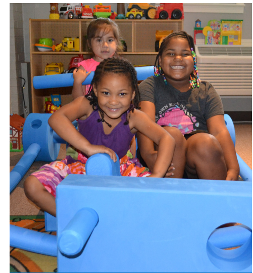
A child’s future begins at home ... and with play.

Child experts say when we make play the foundation of learning, we educate the whole child. Serving more than 8,000 children each year, Family Promise recognizes the solution to family homelessness must include opportunities for recreation and growth that are critical to a child’s development.