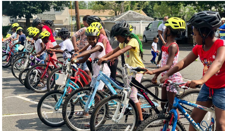
Biking is a new favorite pastime for kids in the FPUC program.

like balancing, braking, and bike safety, and each child received a bike, helmet, lock, and water bottle. Children and parents were thrilled, and FPUC hopes to secure additional bikes for its day center in Elizabeth. Bike donations can be made to Hilltop Bicycles at 30 Eastman Street in Cranford.