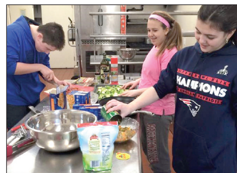
Temple teens prepare dinner for Family Promise guests.

The families are hosted in 10 religious school classrooms. During the week, the students who normally would use the classrooms made welcome and laundry bags and cards for the families.