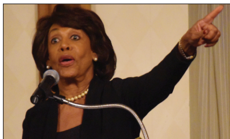
Rep. Maxine Waters points towards the future.

One of those opportunities was presented by Friday's keynote speaker, California Congresswoman Maxine Waters, who discussed her recently-introduced landmark bill, The Ending Homelessness Act of 2016 , which provides for more than $13 billion in emergency relief for the homeless in America. While recognizing the challenges ahead, Rep. Waters said, "This is not an insurmountable