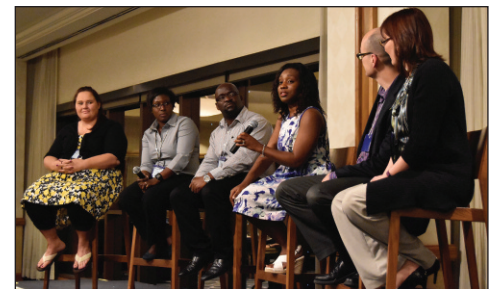
Guest Advisory Council takes center stage.

problem. We know how to end homelessness in America; what is lacking is the political will."