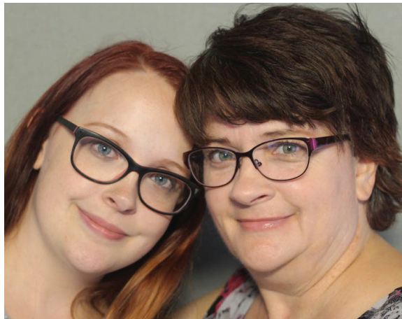
Having faced homelessness, mother and daughter agree that when everything's taken away from you, what's left is what really matters.

Stories have power: the power to spread knowledge, evoke empathy, create change. One Family Promise family managed to do all that and more when they shared their journey from homelessness to independence in an interview aired on National Public Radio and made possible by Family Promise's partnership with StoryCorps™, a public service organization that shares and preserves the stories of Americans.