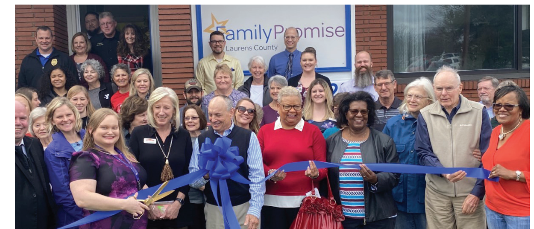
Representatives from Family Promise's newest Affiliate and Belk celebrated the opportunity to serve local families in Laurens County, SC.

The partnership supports more than 50 Affiliates in the Southeast, which serve tens of thousands of children and families.