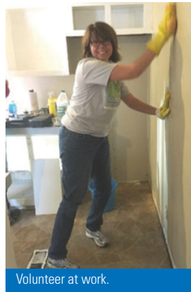
Volunteer at work.