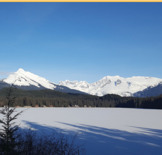
View from Juneau's Day Center.

Based on outcomes of the three initial programs, the goal is to expand Partners in Housing to 10-15 pilot sites representing a cross-section of the regions and demographics served by Family Promise Affiliates. In each one, homeless families will become homeowners—helping to secure their children's futures in the process.