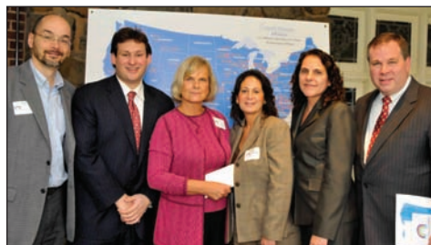
Family Promise meets LifeBridge at Baltusrol Golf Club.