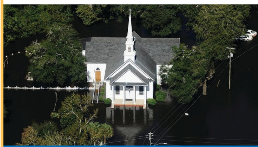
The entire southeast was underwater.